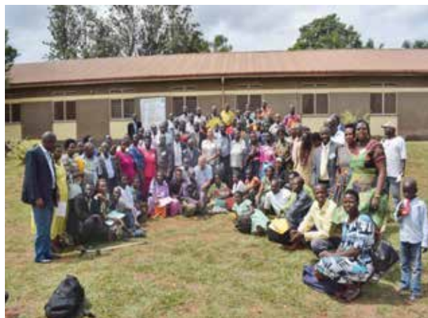
Members during the National Delegates Assembly 2018.

Board of Directors – The UCAA Constitution, Article 6, Section 1, Sub-Section f, stipulates that “The tenure of office of the members of the UCAA Board of Directors shall be three years. However, the Vice Chairperson, Vice Secretary and Vice Treasurer shall normally be elected to the positions of Chairperson, Secretary and Treasurer respectively after serving a three-year term in the former position, if re-confirmed by a majority of District Delegates from their respective regions”. Indeed, in accordance with the UCAA Constitution, in May, the UCAA NDA elected a new UCAA Board of Directors. The 2018/2021 UCAA Board of Directors is composed of four women and five men. It meets on a quarterly basis and is very instrumental in providing an oversight role to the UCAA secretariat staff. The timely decision making and actions has led to a great improvement in our work during the year.