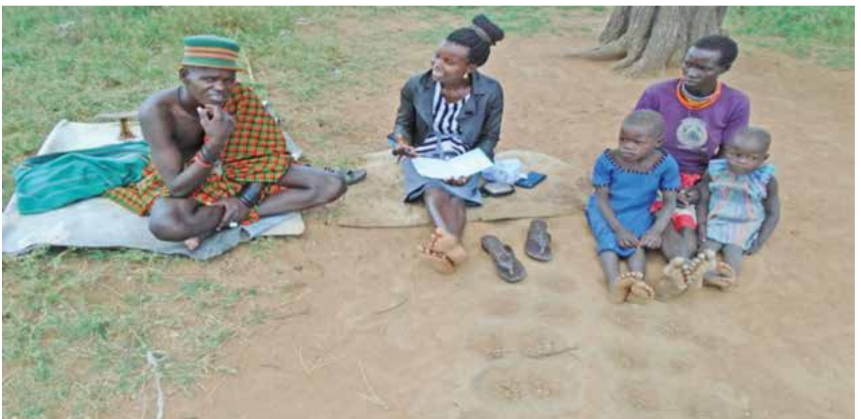
The above photos show the UCAA – GBV Officer handling several cases as she provided counselling and psychosocial support, Napak District