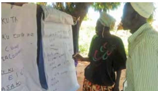
The above photo shows one of the women of FAL classes under instruction in, Romogi Sub County, Yumbe District.

These trainings were conducted within the groups by the identified FAL instructors.