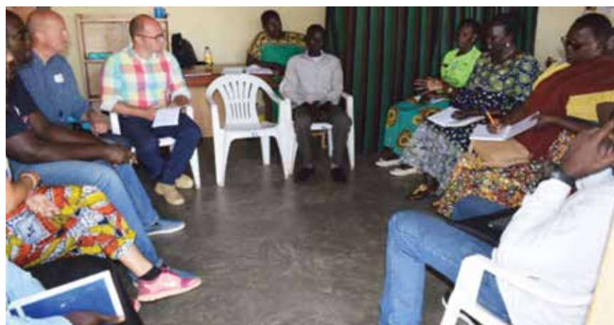
The pictures above show the visitors from Rotterdam Foundation as they interacted with one of the VSLA groups supported by UCAA and the right photo below shows them in a meeting with CaR directors.