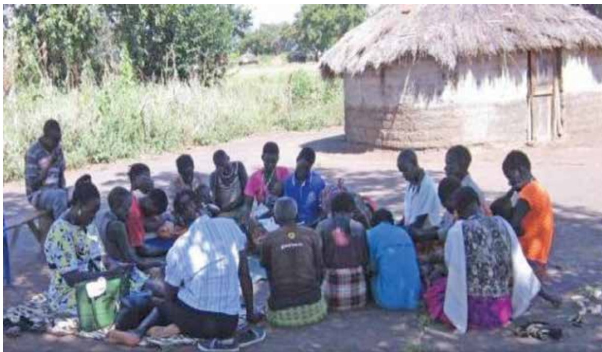
Executive director UCAA observing a moment of prayer at the opening of CAN TEK self-help group meeting in Kapele East village, Adilang sub county Agago District.

The Beneficiaries Used the funds gained to acquire more assets such as Land, Housing, Animals and also meetings Basing Needs such as Education, Medical care and food. In this way, the spirit of Self –reliance was propagated an applied by the beneficiaries as they continued to rely on them-selves for most of their needs. Life among beneficiaries has greatly improved in terms of empowerment Social, Economic and Political.