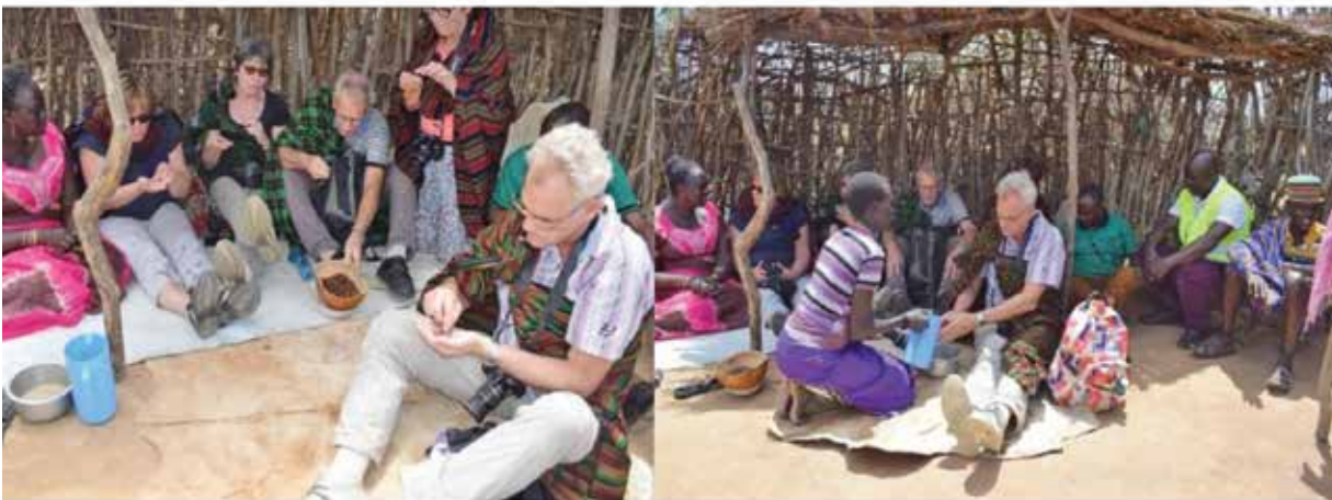
The Kirk in Actie visitors were hosted in one of the supported homes and are having a share on the Karamajong traditional food as per the Karamajong culture.