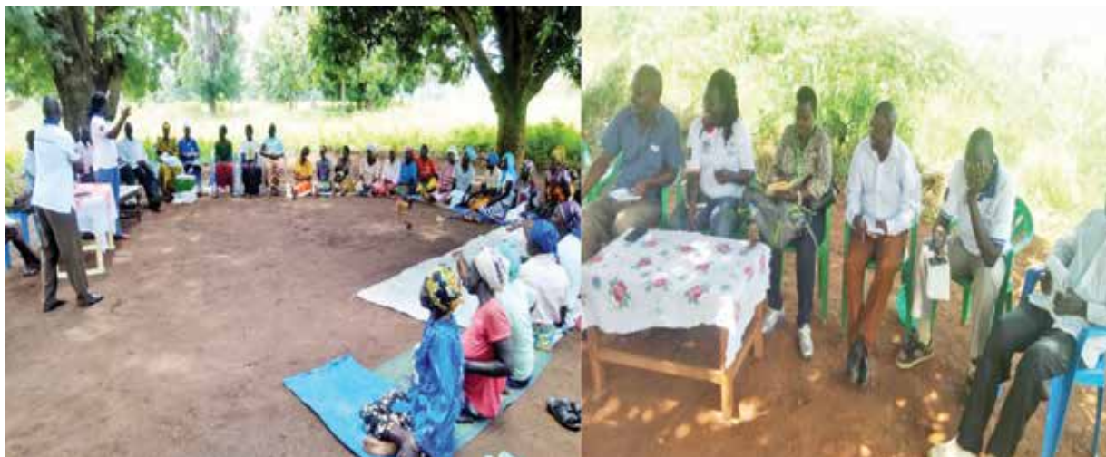
The UCAA and FCA team shared with the members of Hope Women's Group in Ludara Village, Ludara Parish Odravu sub county Yumbe district.

The monitoring visits were conducted in a participatory manner with FCA project officer and Livelihood specialist, UCAA Program Director , Project officer, the WID Project Manager, Project assistants and Community based facilitators for each group were present as well as the group leaders and members.