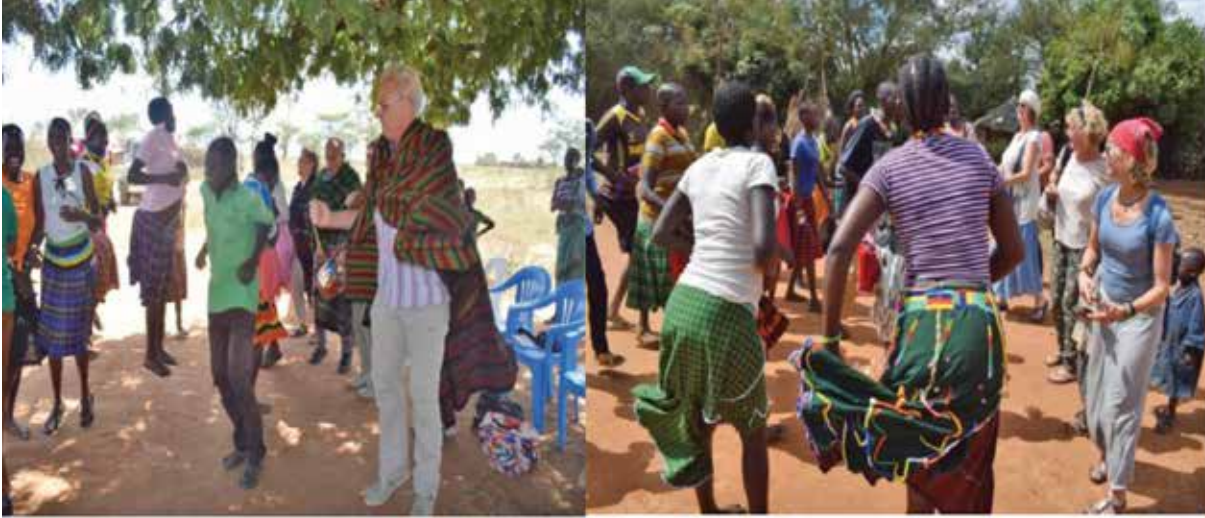
In the above photo are Kerk in Actie members being welcomed by the community

UCAA hosted the team of 21 members from the Netherlands from 25th – 26th October, 2018. They visited a number of people that we work with and the Children at Risk consortium partners especially those who implement activities in Karamoja region. Among the cases visited included VSLA, Lokopo Lucky Savings Group in Lokopo Sub County, a family of a young mother (name withheld) that had mis understandings with her husband and UCAA settled them and are now living together peacefully.