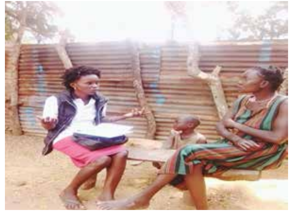
The photos above show UCAA GBV officer during counseling sessions to harmonise peace and reconciliation in families. In the above photo, beside is the Matany Sub County Chief as they visited the case of a husband whose wife had left, but later returned after several counselling sessions, the photo is below.