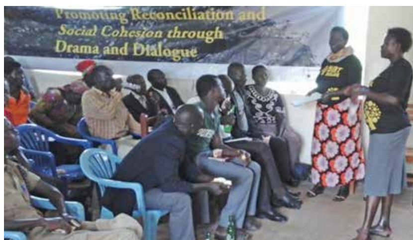
Above is the community of Ogur Sub County in Lira district being undertaken through the Episodes of YatMadit drama for learning.

The intervention has been of great impact in the communities of Northern Uganda. A number of reconciliations has been reached to and people have resorted to living in harmony in some of the communities. There is evidence that people can be able to work together regardless of their cultural difference.