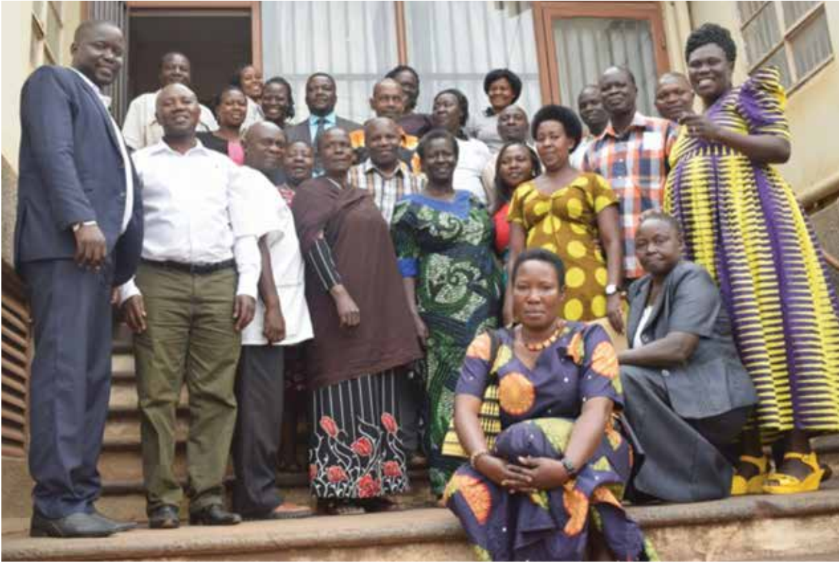
UCAA staff and BOD members posed for a photo during the organizational capacity assessment

Therefore, during the year 2018 a capacity assessment of UCAA was conducted. The organizational capacity assessment was intended to provide an opportunity for UCAA governance, management and staff, membership and rights holders to reflect on the challenges and threats that UCAA has and continues to go through, identify gaps and prioritize the filling of these gaps through an action plan that would feed into a comprehensive organizational development process that will be implemented for three years starting from 2018. The Planned is being implemented.