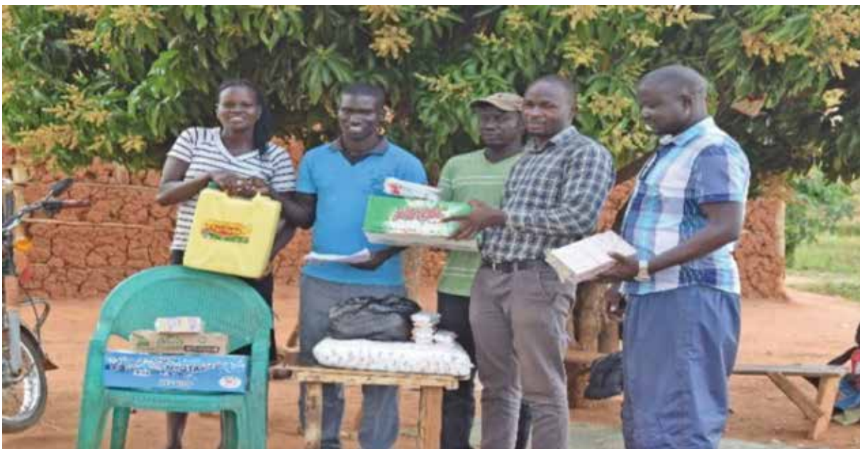
Youth supported with Income Generating Activity start-up items in Napak District.

Objective 5. To strengthen Institutional capacity of UCAA to provide Human Rights Based Approach (HRBA) to development to deliver on its vision, mission and objectives efficiently and effectively.