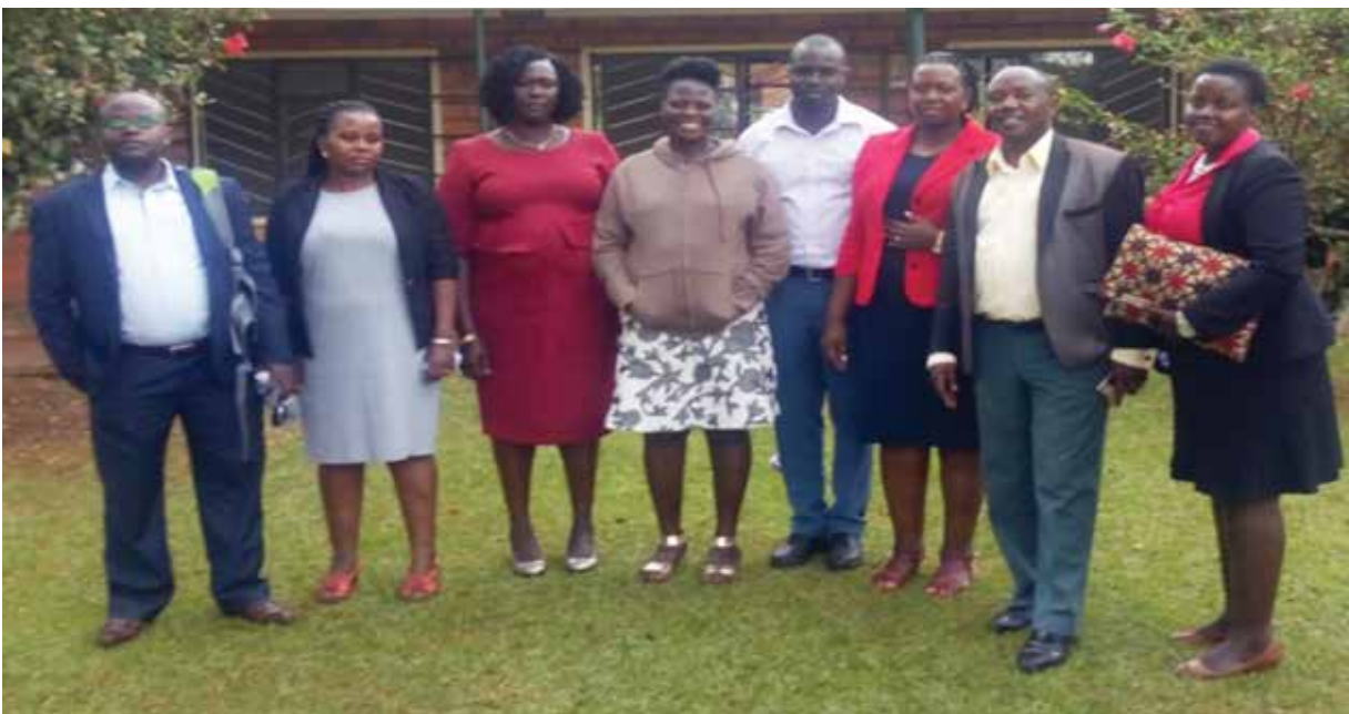
Above is UCAA staff and some staff of FCA that attended the M&E alignment meeting.

UCAA organized and conducted a Planning, Monitoring & Evaluation (PME) meeting for the women in development Project. The meeting was attended by UCAA Women in Development Staff and two staff from FCA, the Monitoring and evaluation officer with the program Officer. The purpose of the meeting was to align the UCAA M&E system to that of Finn-Church Aid (FCA). This is enabling coherence and harmony in the M&E of the project. The meeting was held in Namugongo Kyoto Spiritual Resort.