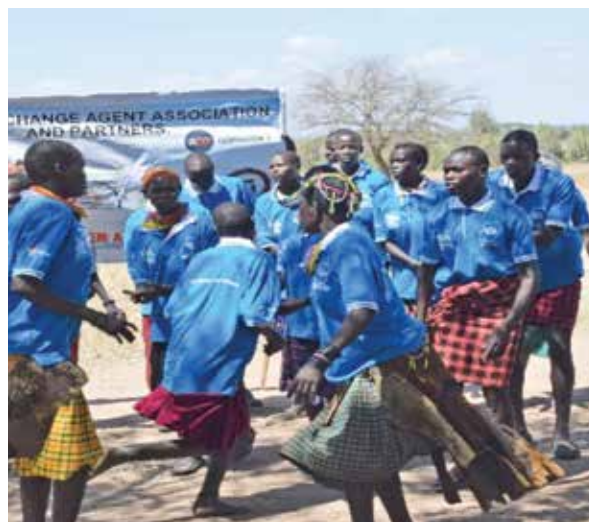
Group members presenting role plays and songs to the community for GBV activism towards the issue of ending Gender Based Violence in Karamoja