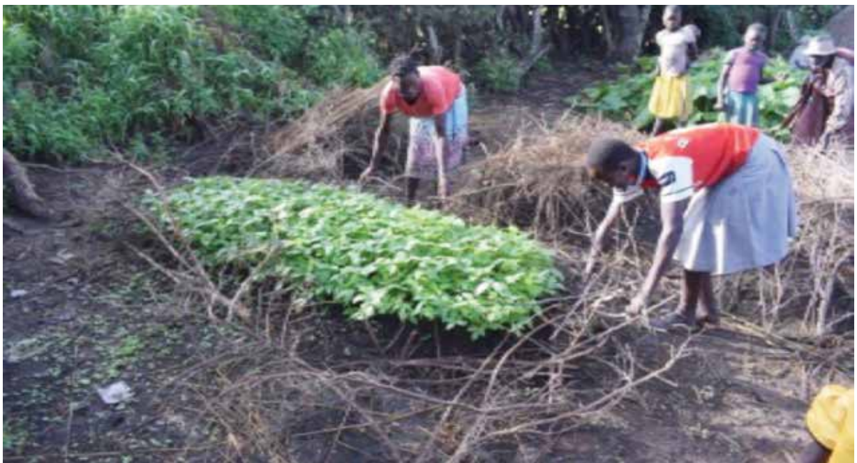
Nakwakwa community, Lorengecora sub county children caregivers monitoring their vegetable gardens