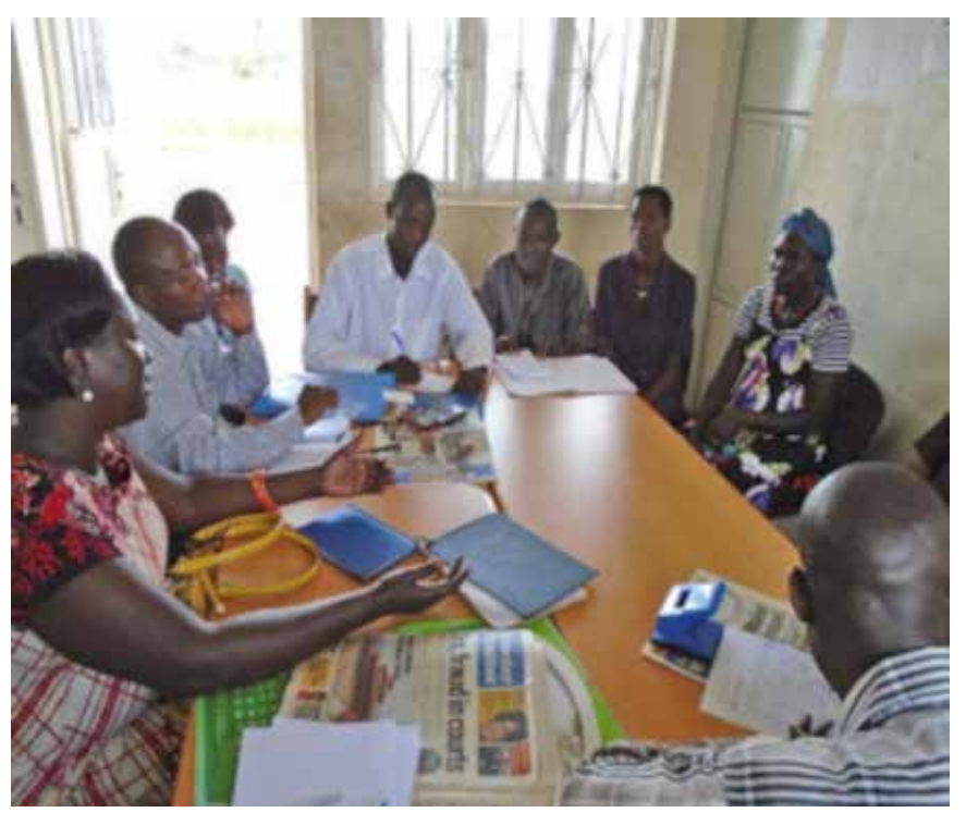
Sensitisation meeting being conducted with local leaders in Napak District.

Gender based violence and child out migration. UCAA conducted trainings of media personnel in GBV and prevention of Child out-migration from Karamoja sub region in Moroto and Napak districts. A total of 20(.6.Female and 14Male) media reporters were trained in Moroto district and a total of 20 ( 4 Female and 16 Male) media representatives were trained in Napak district, they acquired knowledge on