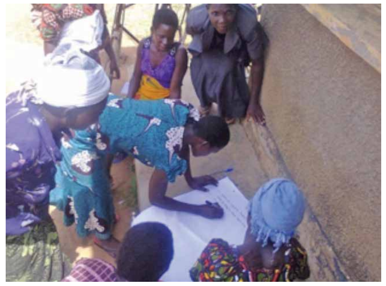
The photo above shows women in group work exercise.