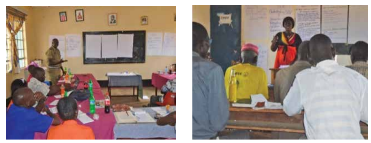
The Child and Family Protection Unit Officer of Napak District with the Sub County Community Development Officer facilitating the Gender Based Violence awareness training for community leaders.

Gender based Violence (GBV). Nena FM in Moroto gave UCAA free air time which was used to conduct lessons on Positive parenting to the entire Karamojong community. UCAA conducted trainings of community leaders and opinion leaders in Gender based Violence (GBV) and prevention of child out-migration from Karamoja sub-region in Matany, Lokopo, Lorengecora and Iriiri sub-counties. A total of 80 Community members attended these sensitization meetings. Two Radio talk shows were also conducted on NENA FM in Moroto to supplement this.