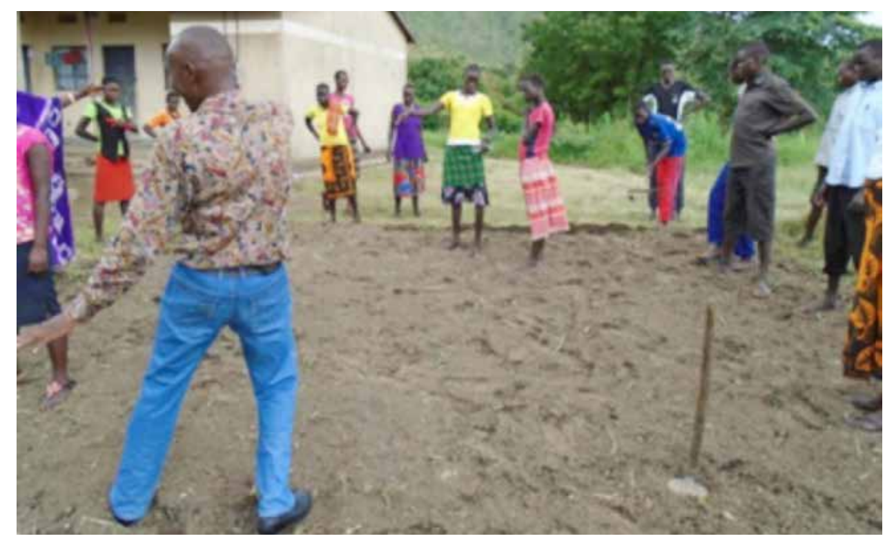
Participants attending practical session in improved agricultural practices