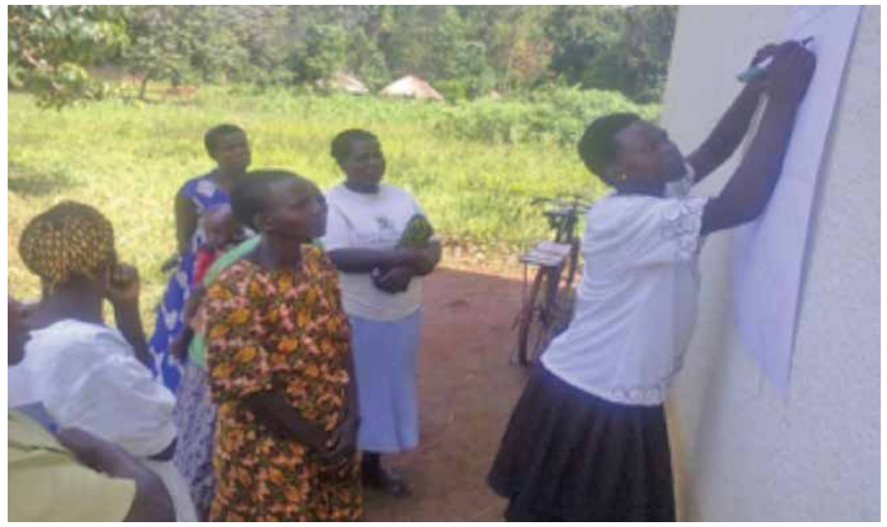
Women under training in Group work exercise in Oyam District.