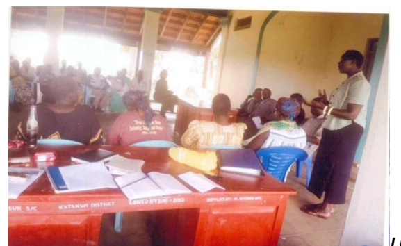
Change Agent Skills during a training on Change Agent Skills Katakwi.

Induction in Change Agent Skills was conducted to some community members of Usuk Sub County in Katakwi and Ngoleriet Sub County in Napak. Attendance was 30 community members of Usuk and 28 of Ngoleriet Sub County in Napak. Participants were taken through the SRPD methodology; evidence based testimonies which helped them to realize the development potentials around them. Change Agent skills were meant to help community members be able to relate own issues with Service delivery in their respective sub counties.